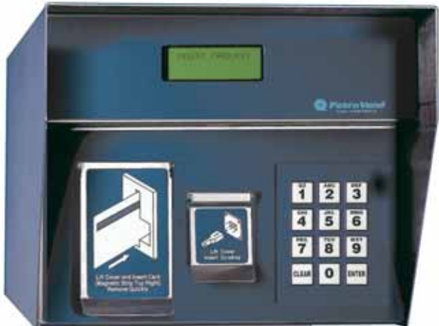
AFC Fuel Island Terminal